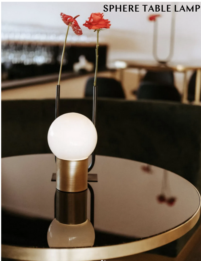
SPHERE TABLE LAMP