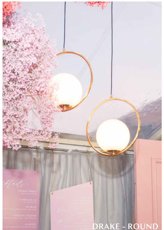
DRAKE - ROUND