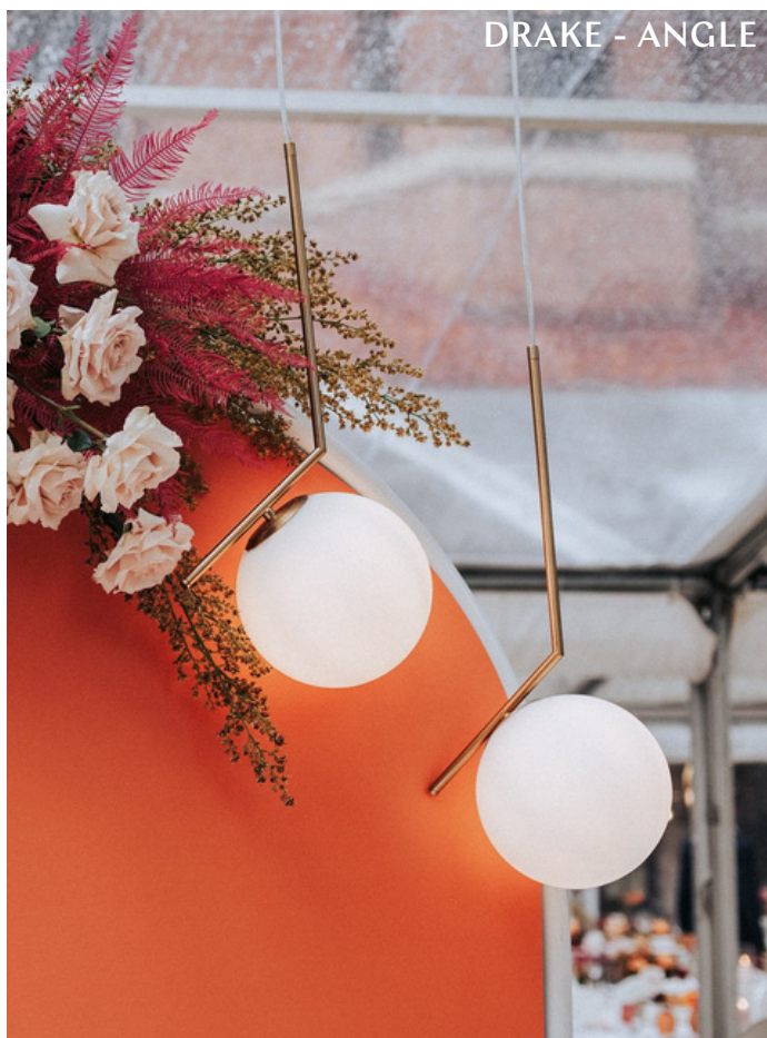
DRAKE - ANGLE