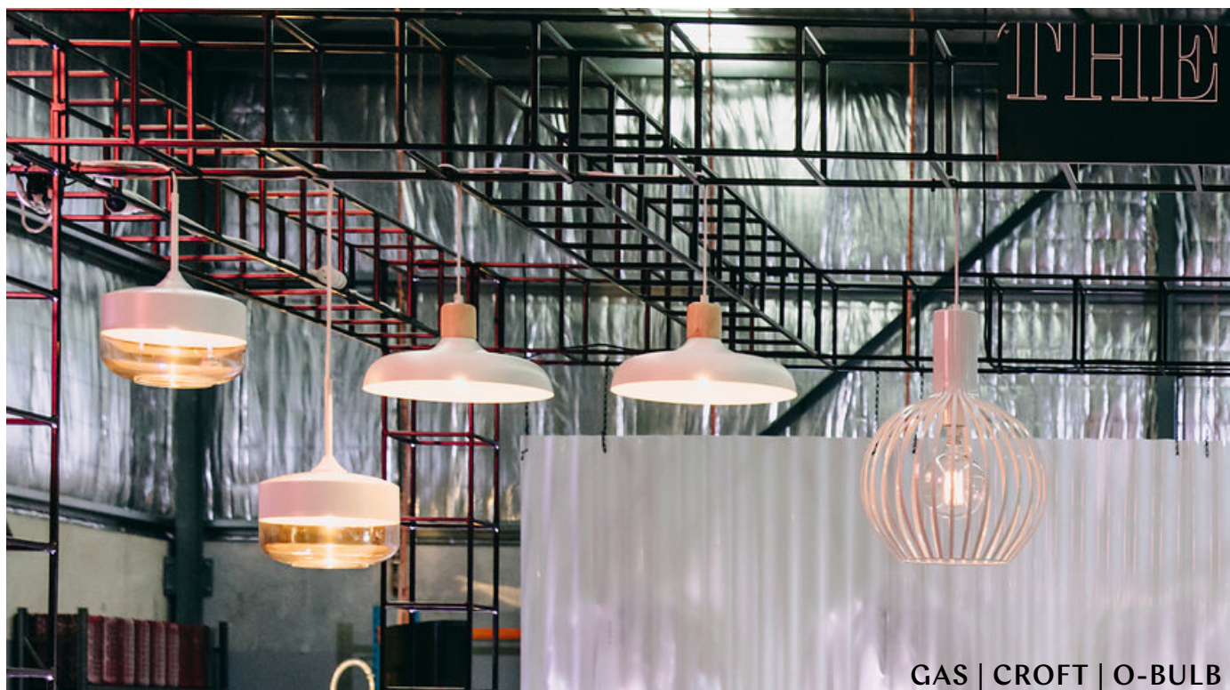
GAS | CROFT | O-BULB