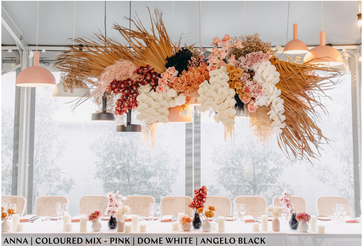
ANNA | COLOURED MIX - PINK | DOME WHITE | ANGELO BLACK