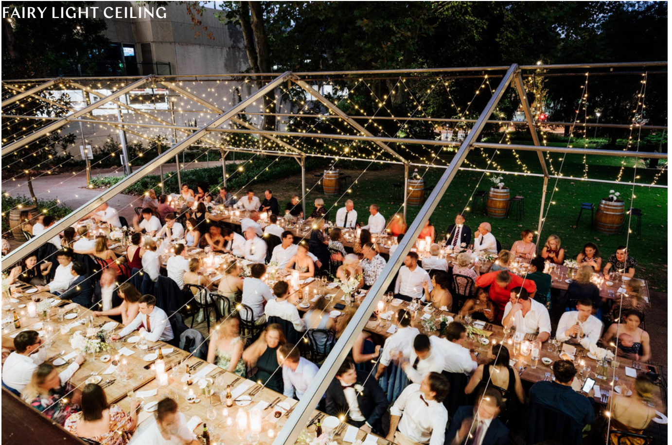
FAIRY LIGHT CEILING