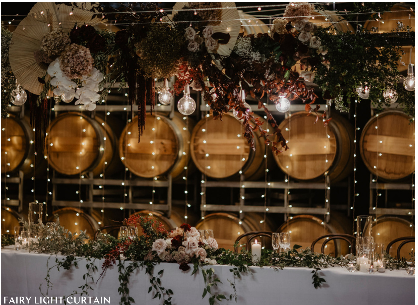
FAIRY LIGHT CURTAIN