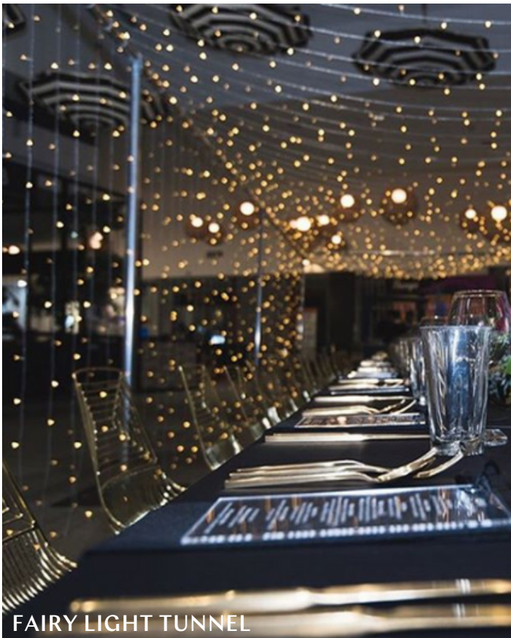
FAIRY LIGHT TUNNEL