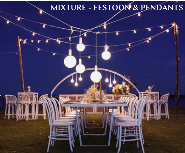
MIXTURE - FESTOON & PENDANTS