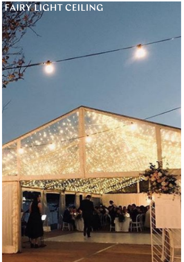
FAIRY LIGHT CEILING