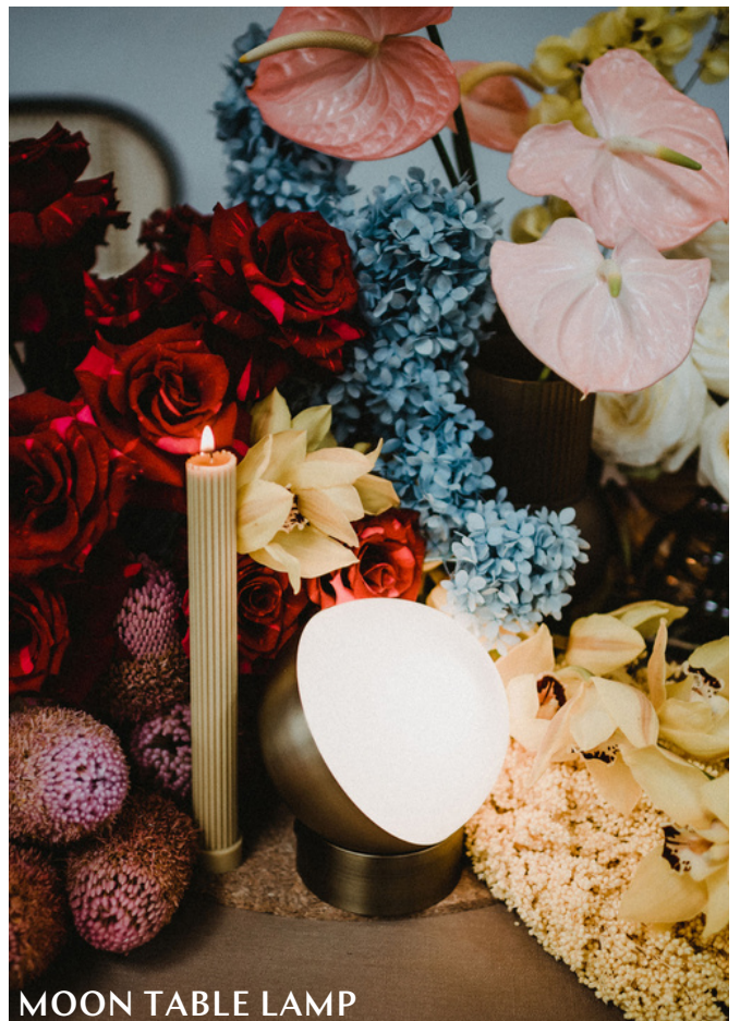
MOON TABLE LAMP