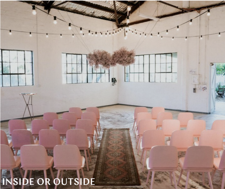
INSIDE OR OUTSIDE