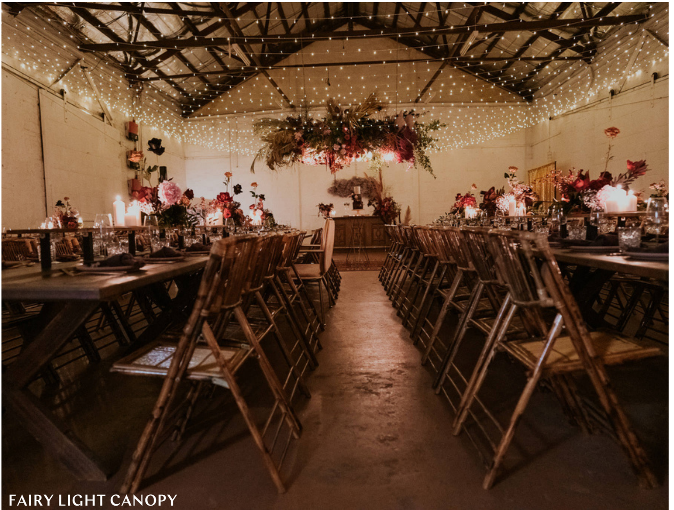
FAIRY LIGHT CANOPY